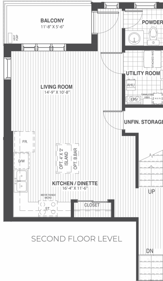
SECOND FLOOR LEVEL